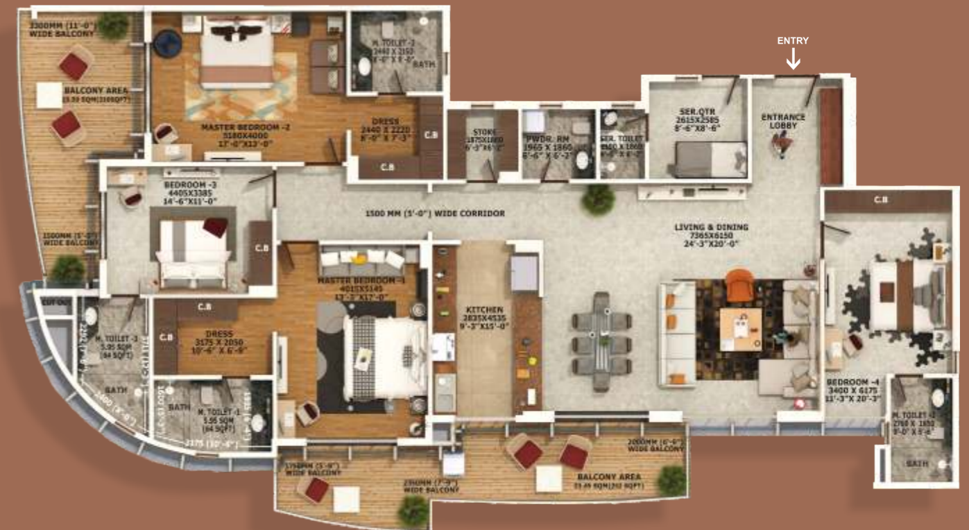
14 th Floor (Unit No.1 & 2)