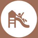
INDOOR KIDS PLAY