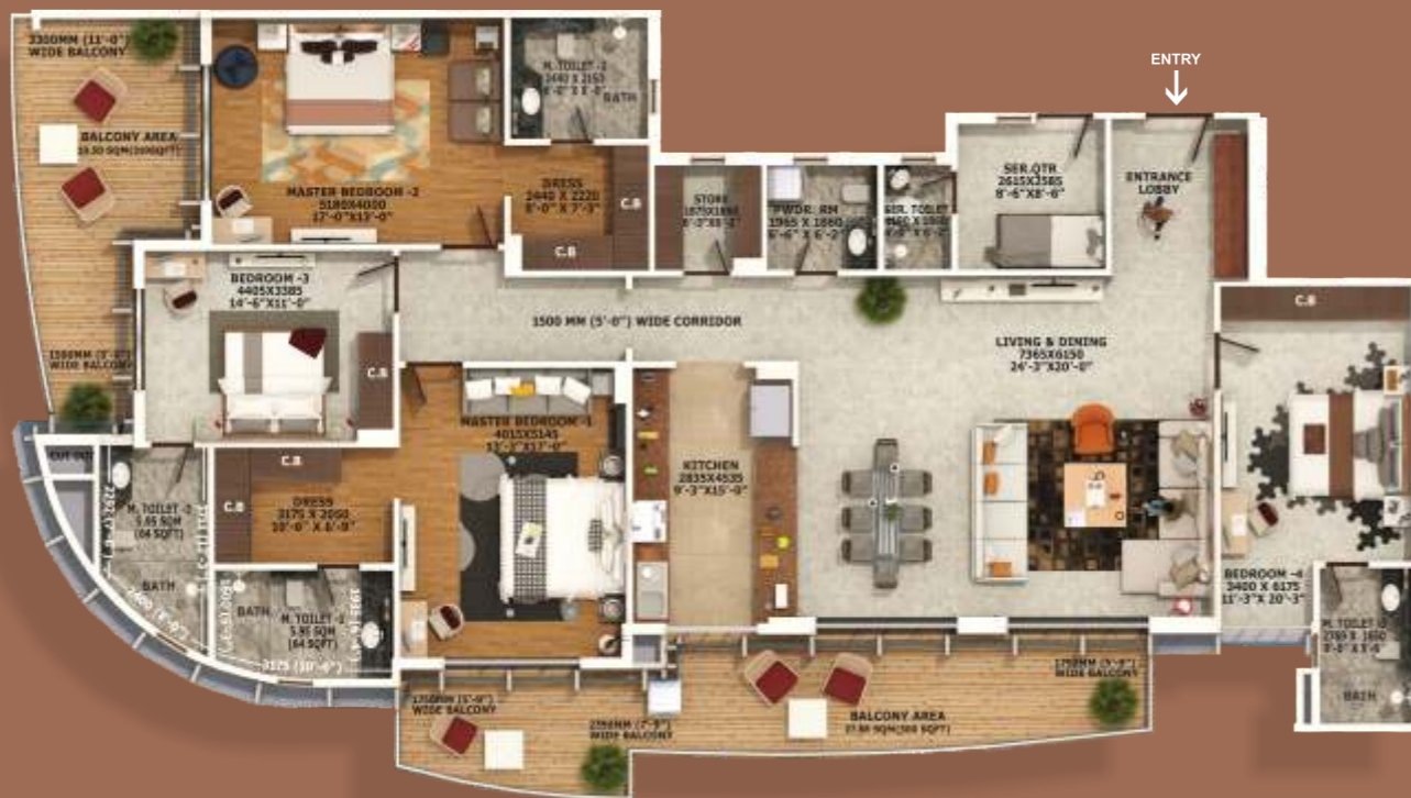
13 th Floor (Unit No.1 & 2)