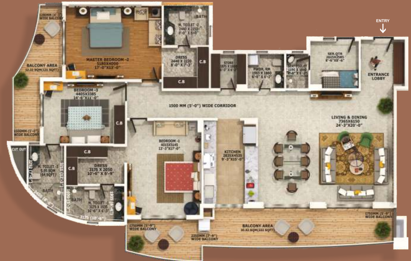
GF & 1 st Floor (Unit No.1)