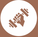
WELL EQUIPPED GYMNASIUM