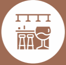
RESTAURANT & BAR