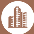
DROP OFF AREA

Serenity isn't your quintessential condominium. What stands it apart, are the multitude of experiences that converge into making it one wholesome community for all age groups and interests.