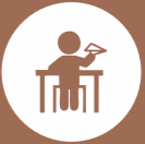
INDOOR HOBBY CLASSES