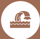
ENTRANCE WELCOMING WITH WATER BODIES