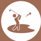
SEAMLESS MOUNDS TOWARDS GOLF