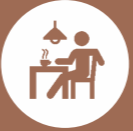
INDOOR SPORTS CAFE