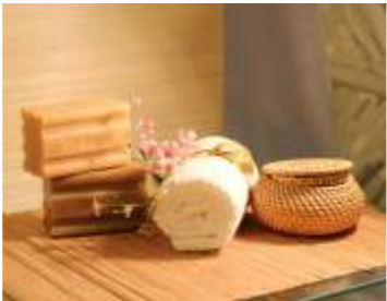
BEAUTY & SPA