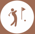
INDOOR GOLF SIMULATOR