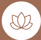
BEAUTY & SPA