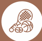
MULTI USE GAME AREA