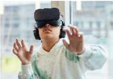
INDOOR CRICKET SIMULATOR