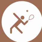
TENNIS/SMALL FOOTBALL COURT