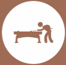
INDOOR TABLE TENNIS/POOL/ BILLIARDS