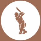
INDOOR CRICKET SIMULATOR