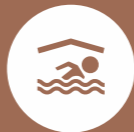
OUTDOOR SWIMMING POOL